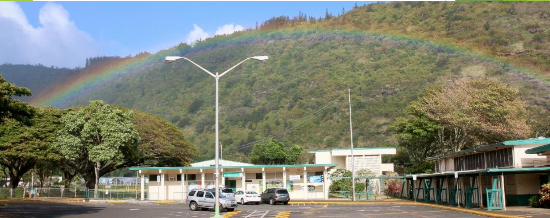
Noelani Elementary School